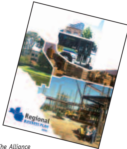
The Alliance partnered with area chambers and other business organizations to create the Regional Business Plan.