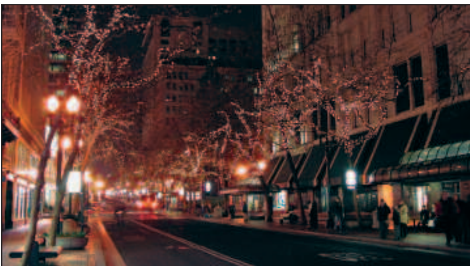
Trees lit with holiday lights line the streets of downtown.

During the year, the Alliance advocated for a strong downtown retail community, working through the Downtown Retail Council. Special promotions attracted visitors to the retail core during the important holiday shopping season, and the tree-lighting program managed by the Alliance on behalf of downtown property owners made the city more festive. The Alliance's Sidewalk Ambassadors (Portland's i's) made visiting downtown even easier, by assisting visitors with directions and information. ●