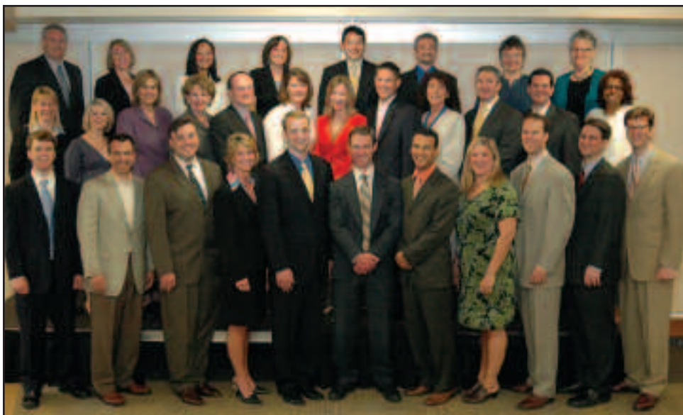
Leadership Portland Class of 2006.

Leadership Portland, our comprehensive leadership development program, received a record number of applications for the class of 2006. Leadership Portland was created by the Alliance to provide individuals from its member firms with the skills and understanding necessary to become future leaders of companies, civic organizations and cities in the Portland region. This program gives participants an understanding of how the community works and issues that challenge the region's economic growth and stability. In June 2006, 35 emerging business leaders graduated from the Leadership Portland program. ●