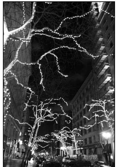
The streets of downtown twinkled during the 2007 holiday season.

With 721 trees lit this past season, our program is among the largest BID operated holiday lighting programs in the country. The Holiday Lighting Program wrapped up on February 1. This year, trees in the retail core were lit for 92 days, up from 76 last year. The lights were turned on earlier to celebrate the grand reopening of the downtown Macy's store. The program also received recognition from Pioneer Courthouse Square for contributing to the tree lights around the square.